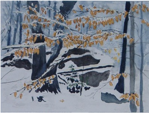
Beech, Rocks, Snow at Rattlesnake Knob