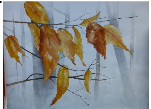
Black Birch Leaves In Fog

Elisa enjoys hiking and photography. She is also a talented watercolor painter and has had art shows regionally. She often paints en plein air and takes great care to be true to the species that she paints.